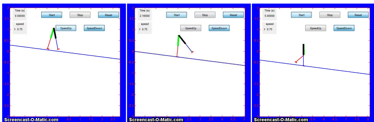
Figure 1. Snapshot of dynamic simulation of bipedal robot walking with multi-point foot contact

Passive and active bipedal robots are used as case studies. A passive bipedal robot performs a walking motion without any actuator and controller, as opposite to an active bipedal robot, which uses feedback control and multiple actuators (typically redundant) at its joints. In order to enable any walking motion, the passive bipedal robot walks on a slope, with an initial velocity and legs angles.