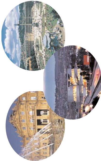
Images of Stuttgart, Germany

http://congress.cimne.upc.es/membranes09