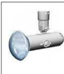
Ref. 0901 Foco 100w Spotlight 100w