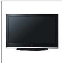
Ref. 1101 Pantalla de plasma Plasma Display