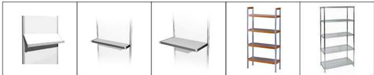
Ref. 0701 Estante Liber* Sloping shelf 100x30