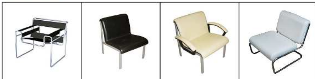
Ref. 0201 Sillón Wassily Wassily armchair 72x75x55