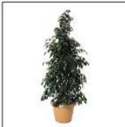
Ref. 1001 Ficus Benjamina Benjamine ficus 150/175