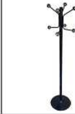
Ref. 0802 Perchero pie Standing coat rack Ø 40x170