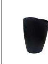
Ref. 0803 Papelera Bin 35x35