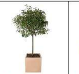
Ref. 1004 Ficus Benjamina bola Benjamine ficus ball 150/170