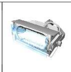
Ref. 0903 Cuarzo 300w Spotlight 100w