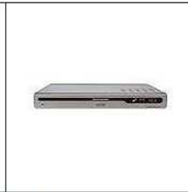
Ref. 1104 DVD Hi-Pro Hi-pro DVD