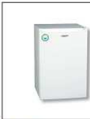
Ref. 0801 Frigorífico Fridge 60x85x60