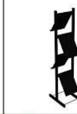
Ref. 0804 Porta folletos Brochure holder 40x140x35