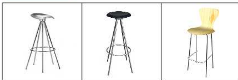
Ref. 0301 Taburete Jamaica Jamaica stool Ø 36x81