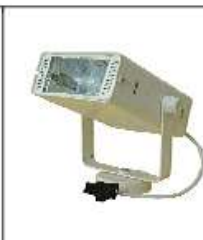
Ref. 0902 Halogenuro 150w HQI 150w