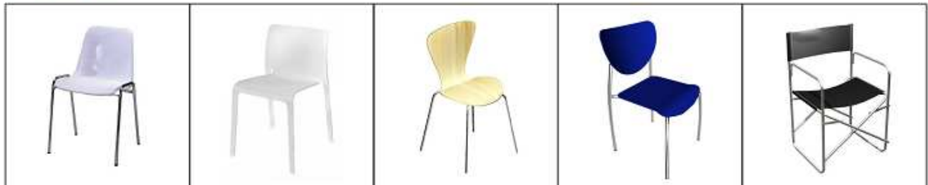
Ref. 0101 Silla blanca/negra White/black chair 50x78x50