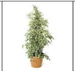
Ref. 1002 Ficus Benjamina Benjamine ficus 200/250