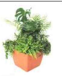
Ref. 1006 Centro floral Floral center 30x55