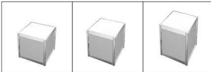
Ref. 0606 Peana Podium 50x50x50