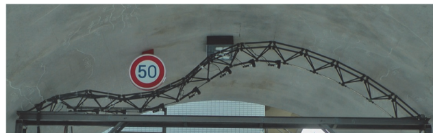
Fig. 2 Shape obstructing obstacles in the actual model experiment in tunnel

"ShapeControl of Variable Guide Frame for Tunnel Wall Inspection to Avoid Obstacles Detected by Laser Range Finder", Proc. of 35th Int. Symp. on Automation and Robotics in Construction , Berlin, Germany, PP.1-7, (2018).