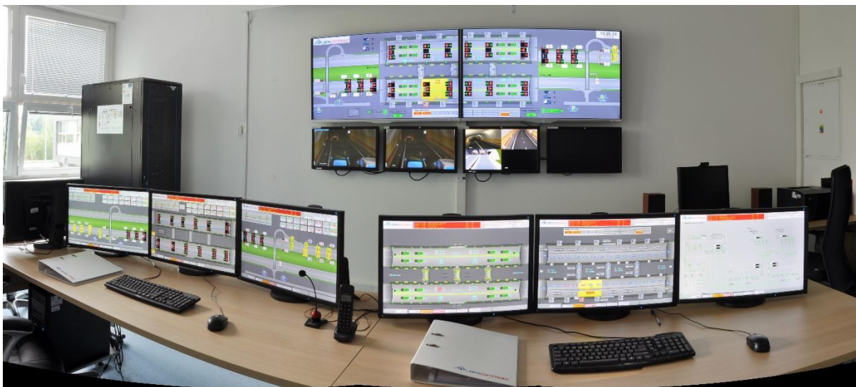
Figure 2: Real photo of Simulator