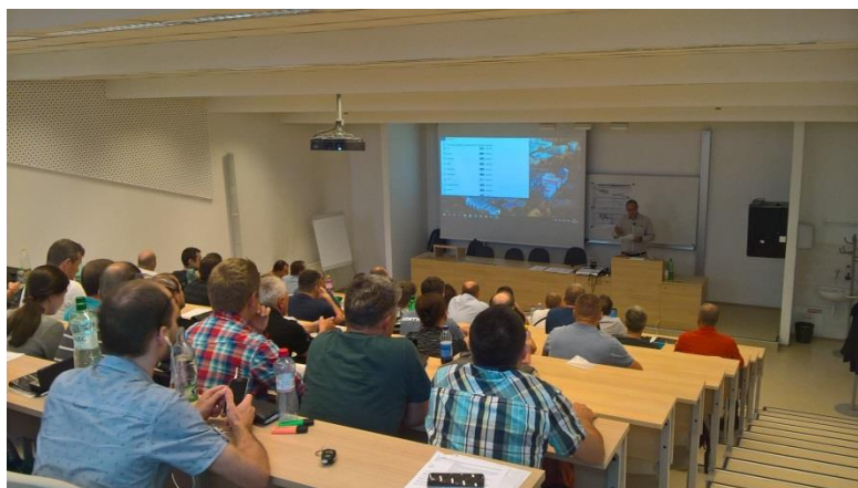
Figure 4: Lectures of basic educational module for 61 participants (09/2017)

This training module is basic (access) course designated for all staff of NMC within the work with tunnels, e.g. operators, tunnel technicians, tunnel specialists and management staff (head of the tunnel, director of center of highway’s and tunnel’s maintenance). This basic module is continued by other modules. The range of module of combined form (distance and attendance form) is 70 h of teaching (53 h of lectures and 17 h of practical exercises), 10 h of self-study and 20 h technical excursion. The goal of course is to acquire knowledge and skills required to manage the operation of the tunnel in all operating states and possible emergency situations. The graduate should know the basic principles of tunnel operation, construction technology of tunnel tubes, technological devices used to control tunnel. Should acquire skills from measurements in the laboratory, have necessary knowledge and understanding of the central control system (CCS) and technological equipment: lighting, ventilation, fire protection, tunnel inspections and maintenance, status evaluation of tunnel, technological devices and sensors of technical parameters needed for rational management of the tunnel. Complete the foundations of rhetoric, communication skills and psychology. Because of three new tunnels put in the operation last year, this module was performed in autumn 2017 (Fig. 4).