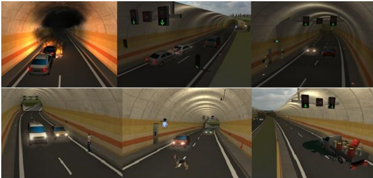
Figure 3: Simulation of emergency events (examples)