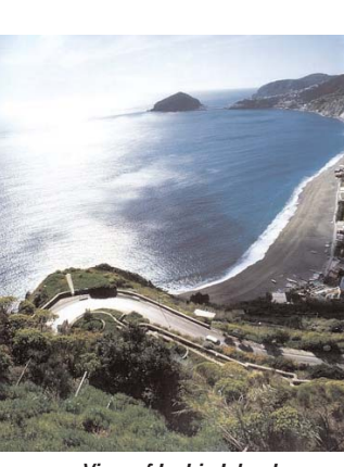
View of Ischia Island