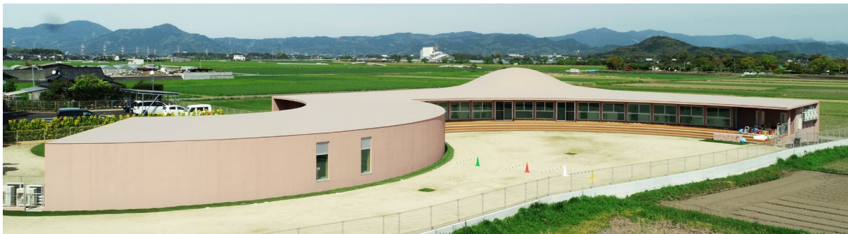
Fig.1 bird view of the Subaru Nursery School

The structural and architectural characteristic of this building is the shape of the roof. The greater part of this roof is made with general flat RC slab. The thickness of the slab is 180[mm] and it was led by the cantilever length of the eaves and the size of the classrooms. On the other hand, the maximum wide of the assembly hall is 15[m]. Of course, the flat slab with 180[mm] thickness can't cover the assembly hall. And then, we did the shape design by sensitivity analysis to minimize the structural strain energy. The shape of the roof changed to the 3D curved surface. In this analysis, we modify the shape (Z coordinate of the nodes) only above the assembly hall. As a result, we could design the lovely roof that is mainly flat and partially undulating with the same thickness RC continuous slab. The architecture merges into the surrounding landscape. We could create the continuous scenery.