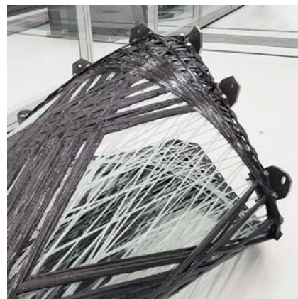
Figure 2. Bundesgartenschau 2019 Fibre Pavilion component