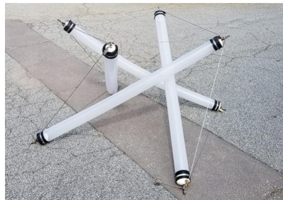
Figure 2. Half-scale tensegrity prototype with inflated polyethylene air-struts.