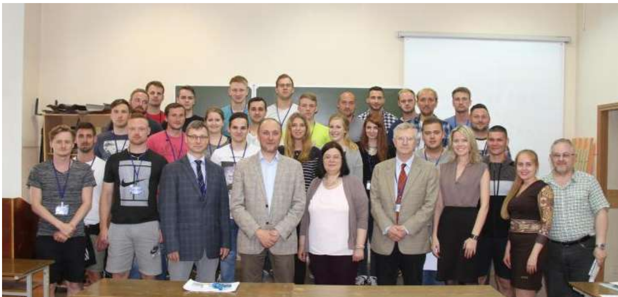
Fig. 2. Participants of the summer geotechnical school on the basis of PNRPU (Russia) together with the Magdeburg-Stendhal University of Applied Sciences (Germany) on June 13-17, 2017