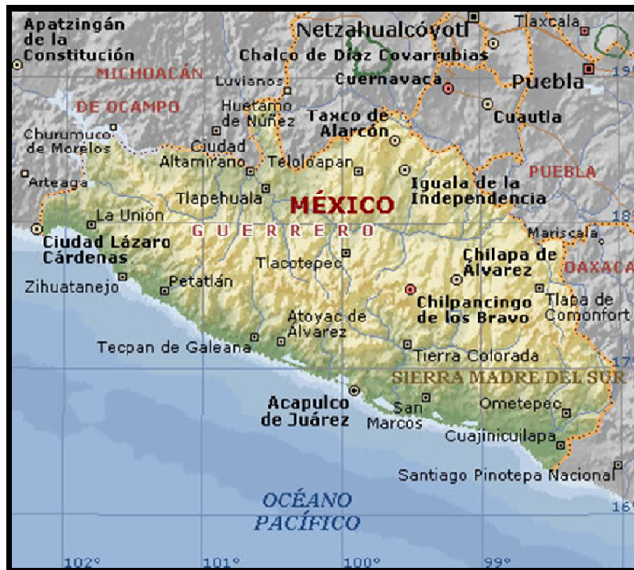
Figure 1 Map of the geographical region of study located at the State of Guerrero in the country of Mexico.