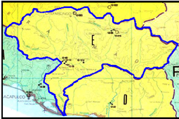
Figure 2 Papagayo river basin